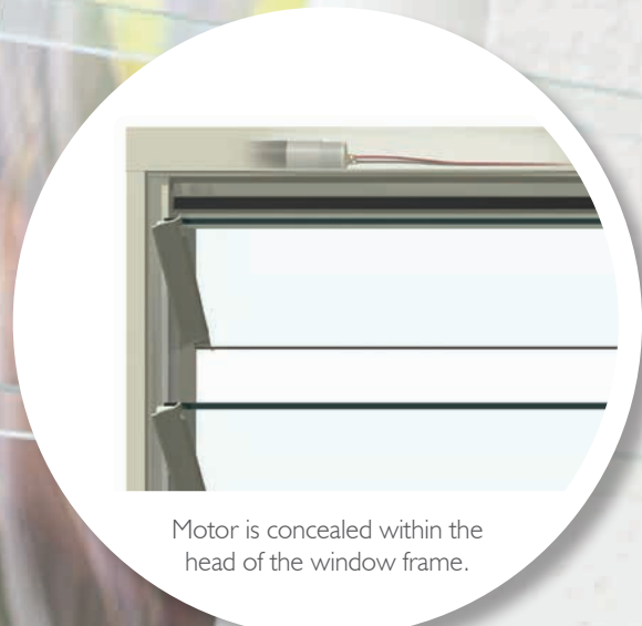
Motor is concealed within the head of the window frame.