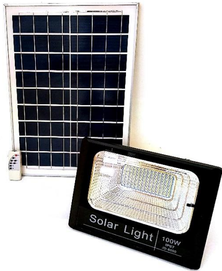
Model: BSR 100watt Solar LED Light (IP65)