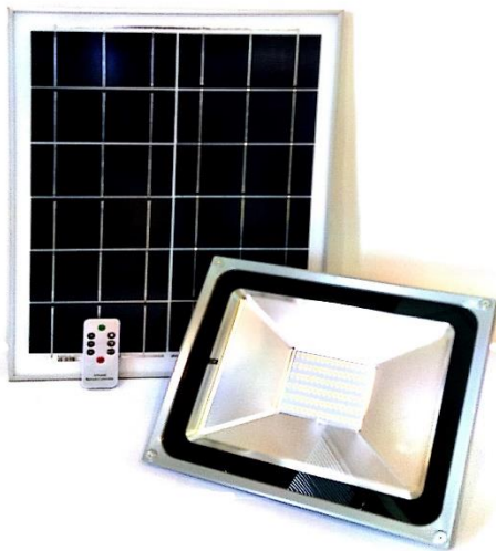
Model: BSR 50watt Solar LED Lights (IP65)