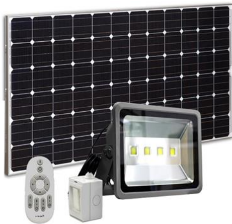
Model: BSR 200 watt Solar LED Light (IP65)

Specification subject to change without notice.